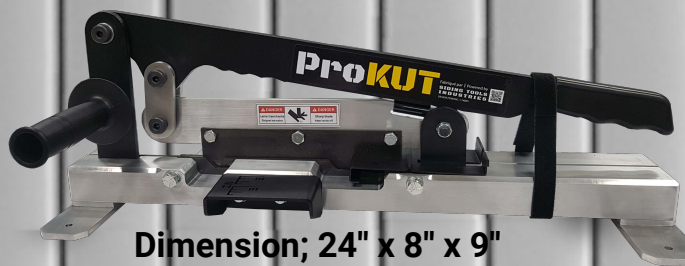
Dimension; 24" x 8" x 9" Weight: 18 lbs