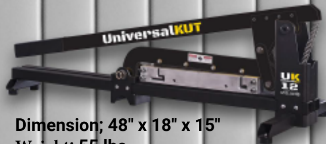
Dimension; 48" x 18" x 15" Weight: 55 lbs